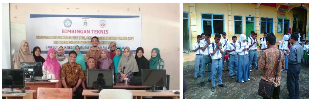
Figure3. Professional Competence Of Educators

Then, one of the teachers also said, "As a teacher, I realize the importance of having a deep understanding of the character principles that I want to teach. Therefore, I actively participate in training and workshops organized by the school to improve my professional competence." An interview with this informant revealed that the interview emphasized the importance of a deep understanding of the character principles taught in his class. He realized that this understanding was crucial for the effectiveness of teaching character values to students. To ensure that he is always up-to-date with the latest methods and principles. This participation is an effort to continue to improve his professional competence, so that he can be more effective in teaching and integrating character values in daily learning. Through this training program, she seeks to support teachers in implementing character principles in the learning process so as to strengthen the overall character development of students.